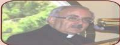
Archbishop Valéry Vienneau "One God, Many Followers"