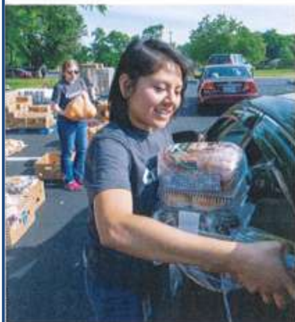
In the poor, Jesus is with us. Here, volunteers work at a food pantry in Nashville.

B efore the resurrection, Jesus likely would have suffered the ravages of illness and lack of proper nutrition that all the people of his time were subject to. After the resurrection, Jesus showed he was exalted with the very power of God. Even his physical appearance had changed.