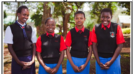
Starehe Girls, Kenya

"I was lucky to be selected for the Chalice sponsorship program, which catered to my school needs, as well as provided a sponsor to walk with me throughout my education journey. Thank you Chalice, for restoring hope in us."