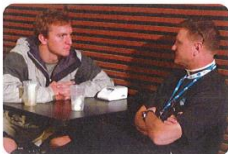
A pilgrim takes time during a World Youth Day event to speak with a priest about vocations.

If you are truly open to the will of God in your own life, if you are willing to listen to God’s call and make your decisions and choices based on this experience, preferably with the guidance of a confessor or spiritual director, you will discover the true happiness that a real vocation can bring. ●