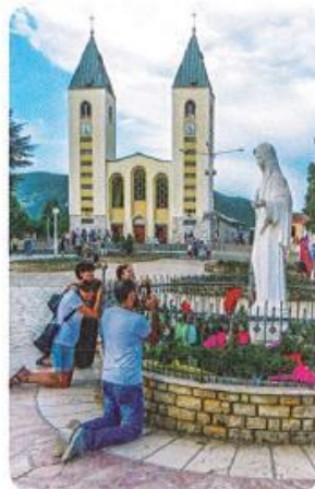
FRANCIS IN FRONT OF THE STATUE OF OUR LADY OF LORAIN, MEDJUGORJE, BOSNIA AND HERZEGOVINA

It is important to note whether the private revelation is contrary to the faith or the morals of the Church, and whether a particular revelation brings one closer to God. ●