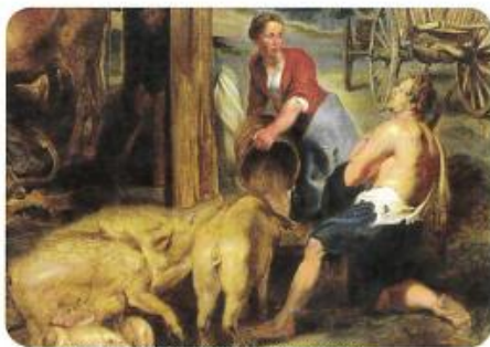
THE PRODIGAL SON, PETER PAUL RUBENS